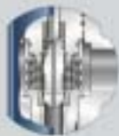
Cavnoise Valve Trim