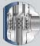
Cavrosion-Cavnoise Valve Trim

ACV-8 adjustable choke valves have wide applications in oil, gas, and water service. Three body sizes allow proper matching of the choke to the expected flow rate. Maximum working pressures to 5000 psi [34,475 kPa] are standard on the ACV-8 series valves. An easily read indicator ring, calibrated in sixty-fourths of an inch, provides accurate flow control, and a spring-loaded Teflon ® packing design forms a bubble-tight stem seal.