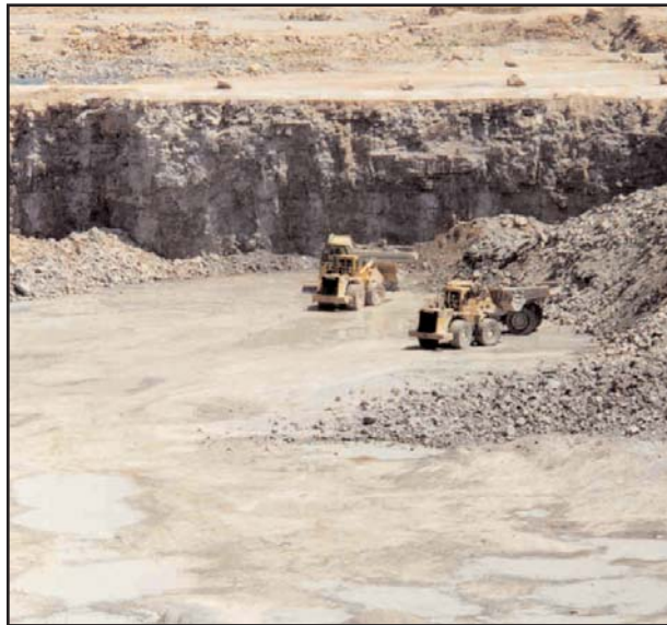
Aggregate recovery at the Acton Quarry