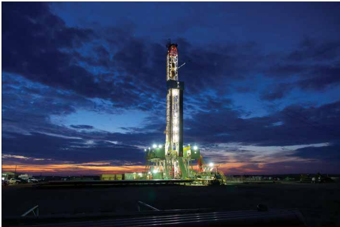
Precision Drilling's Rig 580, a Super Triple 1500 series rig, works in Oklahoma. The company is using similar-design rigs, deployed on turnkey jobs in Louisiana, to deploy the new remote directional drilling service. Turnkey jobs are serving as a proving ground for the service.