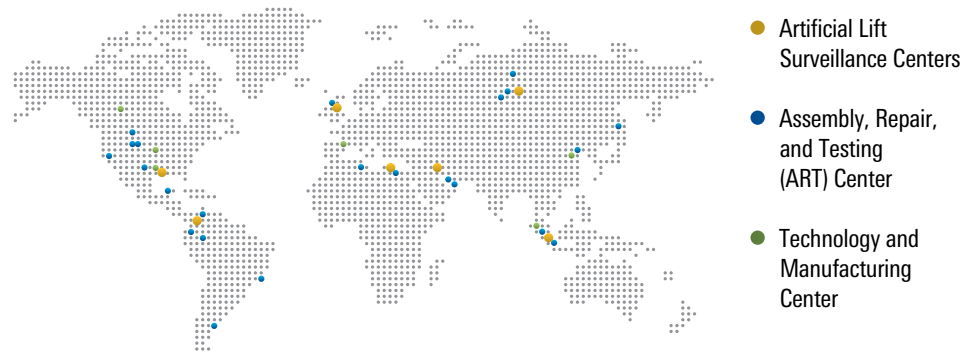
Experienced engineers monitor customers' artificial lift systems from surveillance centers around the world, ensuring rapid reporting and remediation efforts.

Our experienced surveillance engineers monitor alarms and alerts 24/7/365 at ALSCs around the world. ALSC engineers review alarm events for all measurements at the wellsite, from motor temperature to continuous flow. Using Schlumberger best practices and systematic workflows, ALSC engineers identify probable causes and quickly report remediation options for rapid implementation. This helps operators maximize system run life and prevent or resolve downtime to optimize production while reducing total cost of ownership over the life of the well.