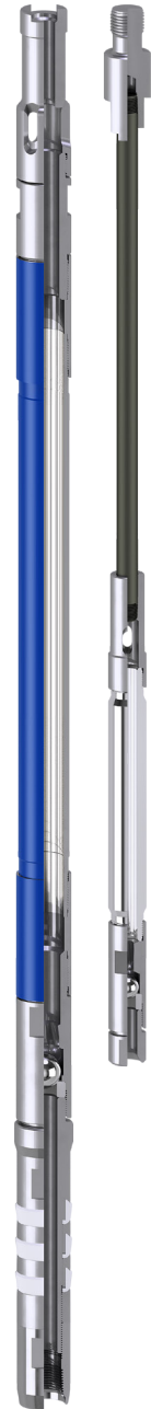
RHB API insert pump.