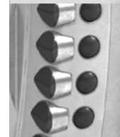
SRT diamond inserts behind the Axe elements improve stability.