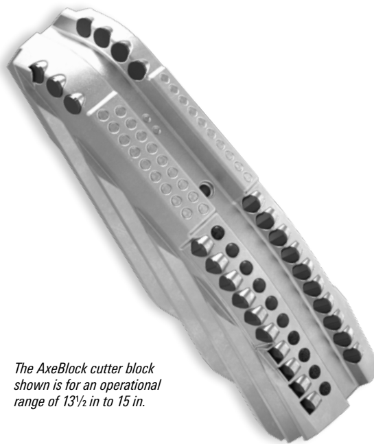
The AxeBlock cutter block shown is for an operational range of 13½ in to 15 in.

In medium to hard formations with UCS greater than 5,000 psi [35 MPa], conventional cutter blocks lack the necessary stabilization qualities to reduce torque while improving performance during hole-enlargement-while-drilling (HEWD) operations. The reduced cutting force required by Axe elements translates to less overall torque, reduced reactive torque fluctuation, and better toolface control in aggressive-curve applications. This advantage enables better build rates and higher overall ROP, maximizing production zone exposure and minimizing drilling time.