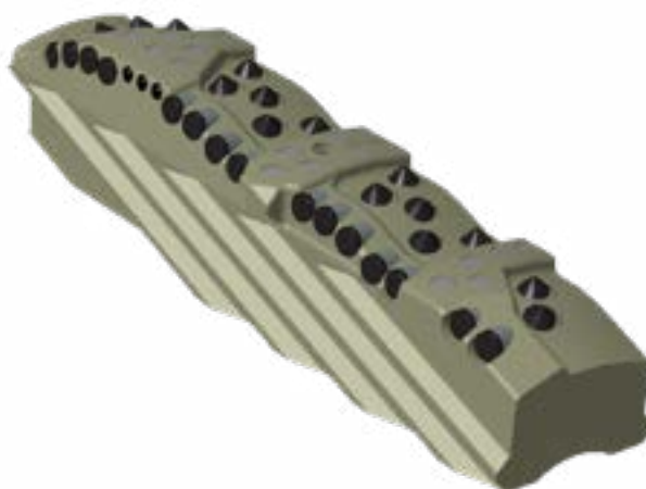
The StingBlock cutter block shown is for an operational range of 11 to 12¼ in.

In high-impact and challenging applications, cutter blocks with a standard-gauge pad lack the necessary stabilization when encountering hard and interbedded formations. The increased area of the main gauge pad uniformly distributes the cutter block forces, enabling significantly enhanced stability with lower lateral displacement. During testing of multiple cutter block sizes in different formations, finite element analysis (FEA) simulation studies show an average of 65% less lateral vibration compared with standard blocks. Full-scale drilling tests demonstrated an average reduction of 83% in lateral vibration.