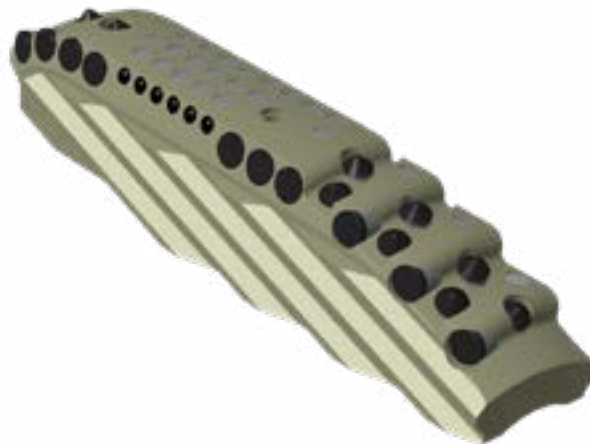
The StingBlock cutter block shown is for an operational range of 9 to 10¼ in.

In high-impact and challenging applications, cutter blocks with a standard-gauge pad lack the necessary stabilization when encountering hard and interbedded formations. The increased area of the main gauge pad uniformly distributes the cutter block forces, enabling significantly enhanced stability with lower lateral displacement. During testing of multiple cutter block sizes in different formations, finite element analysis (FEA) simulation studies show an average of 65% less lateral vibration compared with standard blocks. Full-scale drilling tests demonstrated an average reduction of 83% in lateral vibration.