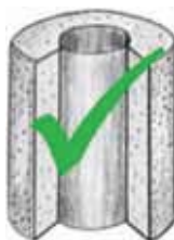
Fig. 1—Cement for well integrity.

The oil industry has also moved to the extreme conditions of deepwater offshore. Seafloor temperatures near freezing are common in the deepwater operations on the east coast of Canada. In addition to the cold temperatures, the cement slurries must also achieve early compressive strength in the high-pressure environment. As wells are drilled in water depths greater than 2300 m, the cement slurries must perform in pressures greater than 23 MPa at the seafloor. Cement systems with short transition times and early compressive strength development are necessary to provide structural support for the well. These cement systems must also be formulated to transition quickly from a gel state to a set state so that there is minimal risk of annular flow.