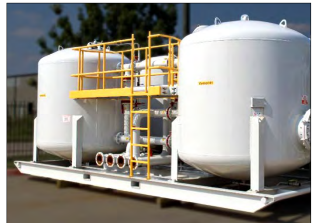
Advanced regenerative water treatment media vessels.