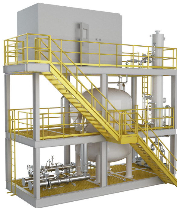
Commercial CDX system including hydrogen generation unit.

A pilot test of the CDX system was undertaken to assess the system's processing functionality from pretreatment through hydrogen generation and mixing to catalytic reaction, where deoxygenation occurs. For the test, a prototype at the Texas A&M Galveston campus treated Galveston Bay seawater, which typically has >100 ppm of total suspended solids. Using prefiltration, engineers set an outlet dissolved oxygen concentration goal of 20–50 ppb. After operating the system 24/7 for 8 months, the CDX system consistently reduced the outlet dissolved oxygen concentration of the seawater to between 2.5 and 10 ppb with a hydrogen generation cycle of only 3 minutes.