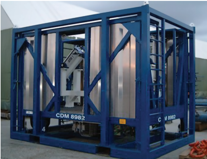
ReelCONNECT system assembly skid.